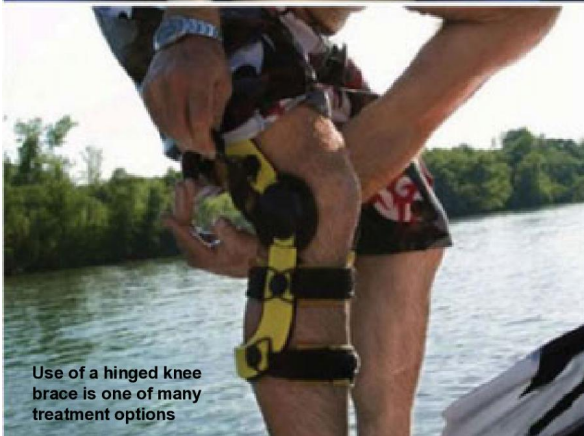
Use of a hinged knee brace is one of many treatment options

For fractures that have not shifted, surgery may not be needed. The most common non-surgical treatment is a short leg, non-weightbearing cast or a hinged knee brace, combined with physical therapy and rest. Fractures that have shifted require surgery.