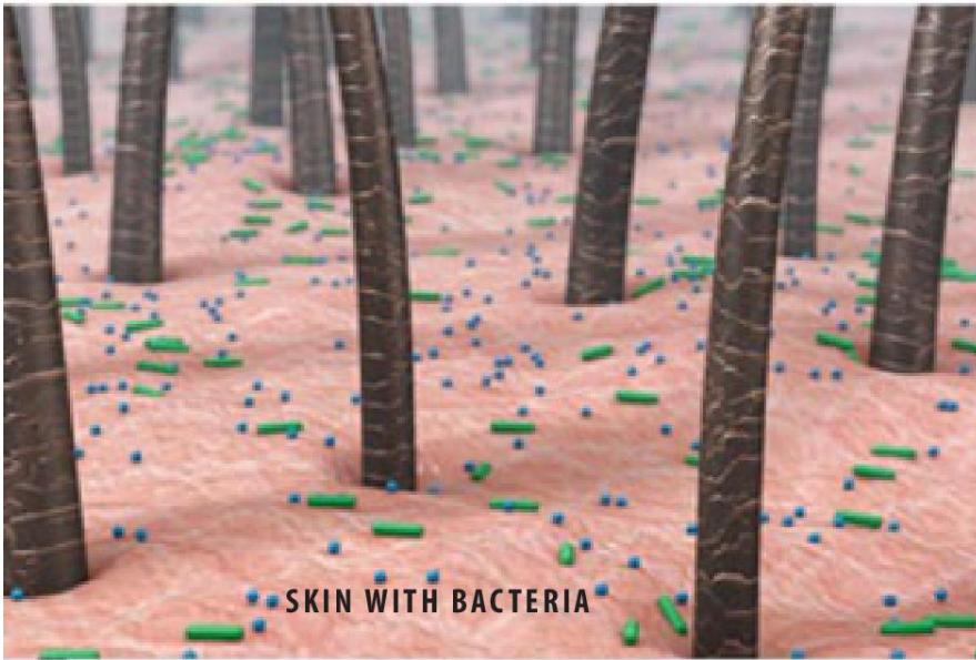
SKIN WITH BACTERIA