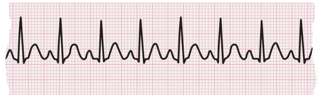
ECG strip showing tachycardia