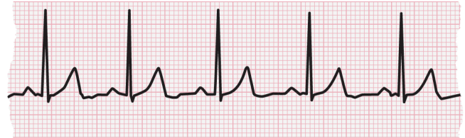
ECG strip showing a normal heartbeat